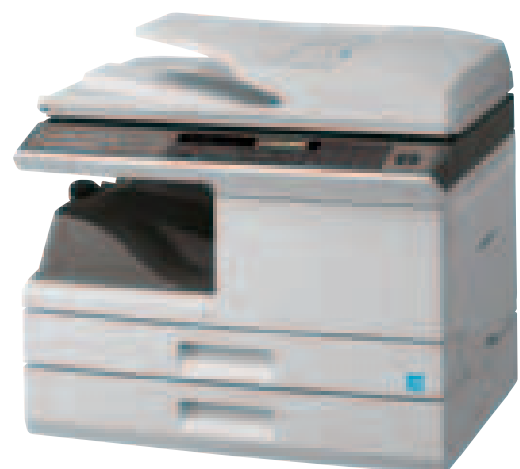
Shown with RSPF, optional second paper tray and fax kit